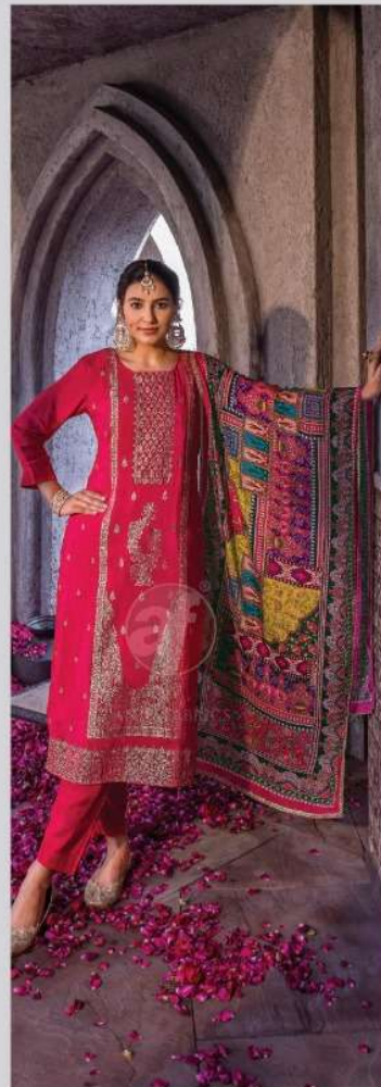
DASTOOR 3625 Volume 3