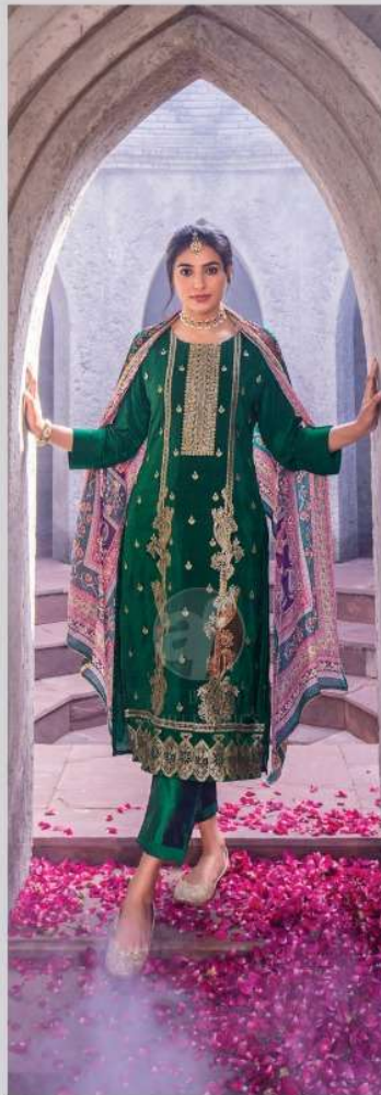
DASTOOR 3622 Volume 5