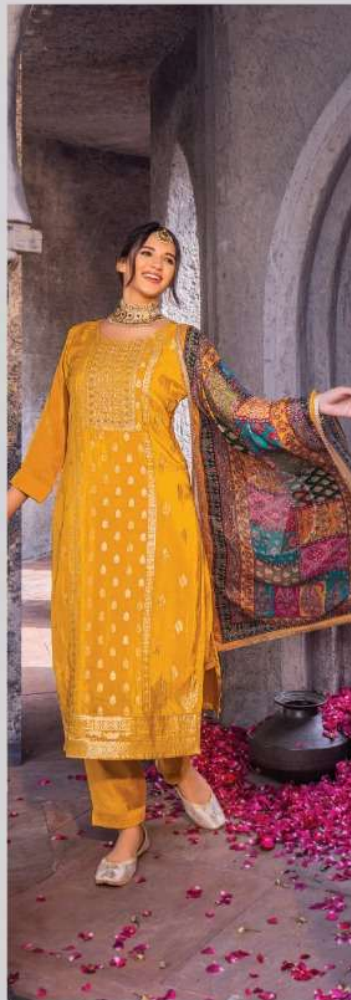
DASTOOR 3624 Volume 3