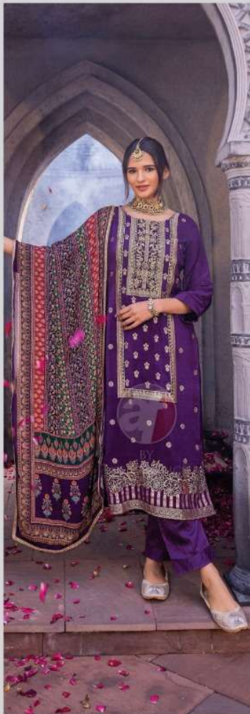
DASTOOR 3621 Volume 5