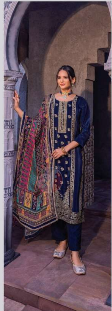
DASTOOR 3623 Volume 5